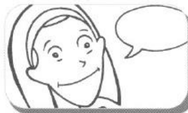
10 Actually, _____

Now, think of your own excuse and write it here.