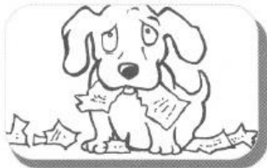
1 The dog ate it.